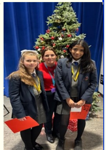
Poetry competition 2024 winners